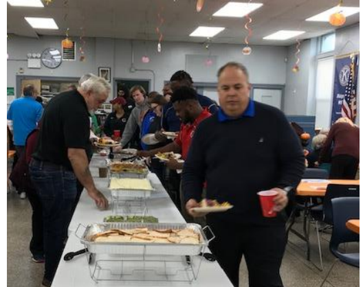
Food Tables with folks lined up on both sides to speed up the process.