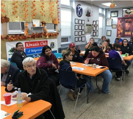
Right half of the Clubhouse with over 30 members and friends.