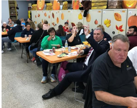
Left half of the Clubhouse with over 30 members and friends.