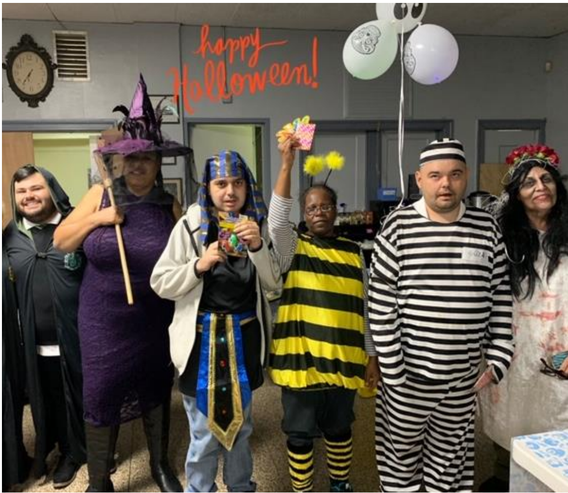
AKTION Club Members and their winning costumes at the Halloween Party