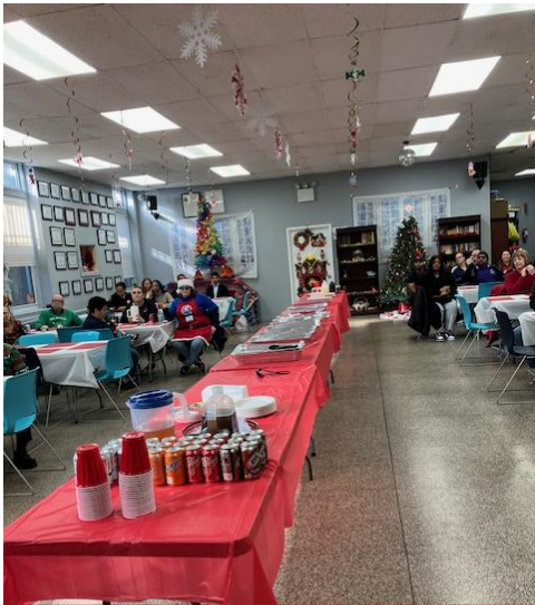
This is what the table should actually look like in the photo below.

Yes Santa, I understand that you are busy at this time of the year and can't make the meeting but I still want to chat with you about a couple of our Everyday Hero Awardees and see if you can let the Chief know that if he wants to be on the NICE List, a couple of these folks need to get promoted this year!!!