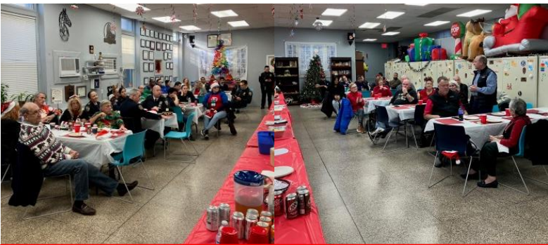
If you look closely, this picture, it is actually two pictures that are laid out side by side to show the full house attendance. LOL