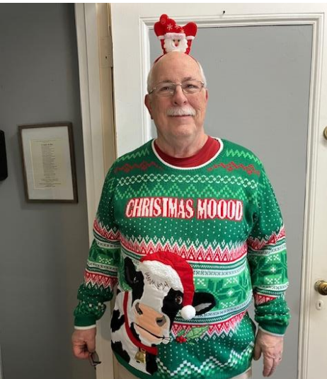
MOOOVING RIGHT ALONG