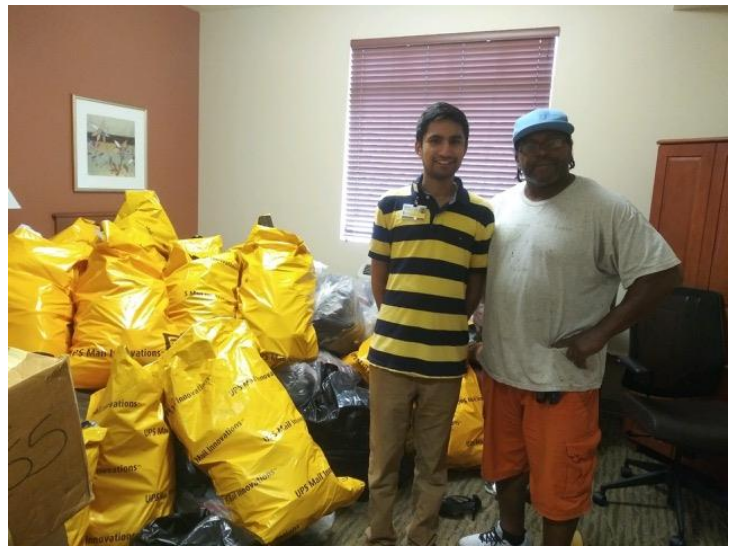
The shoes were donated to St. Joseph's Hospital in Maryland to send kids to Disney.